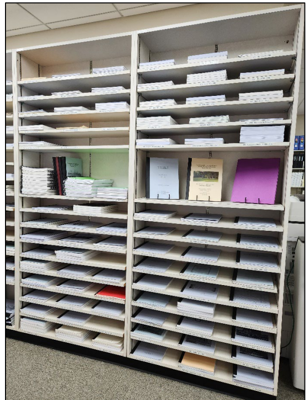
Books for Sale