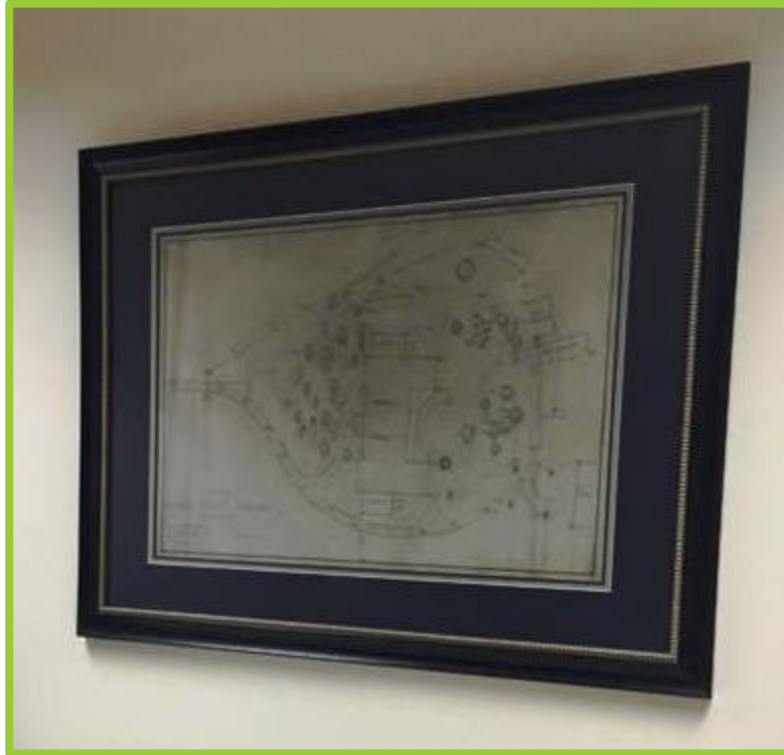
De-acidification and framing of 1915 Infirmary Building Drawing