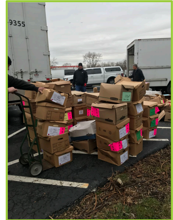
BODD document destruction shred, March 2018