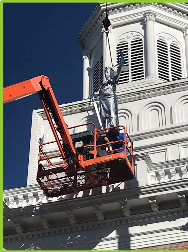
2017 Return of Lady Justice on the Old Court House