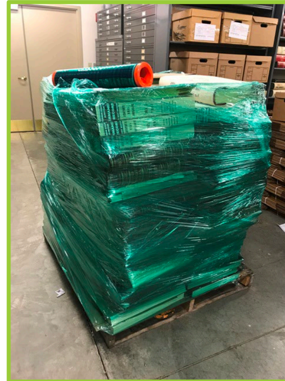
special media disposal of obsolete records, 2017